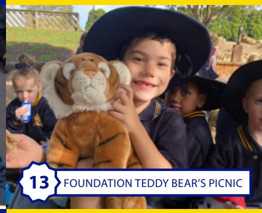
13 FOUNDATION TEDDY BEAR'S PICNIC