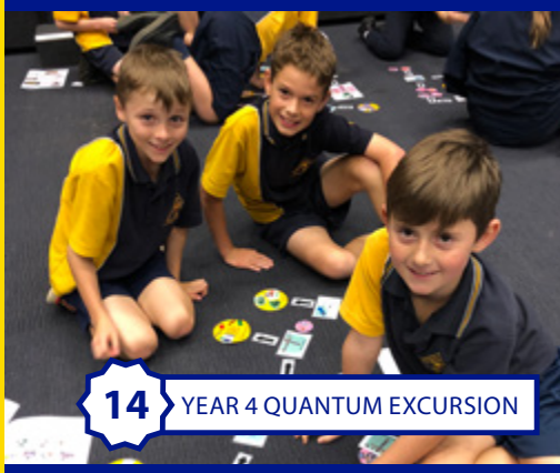
14 YEAR 4 QUANTUM EXCURSION

Monday 2nd October to Wednesday 20th December