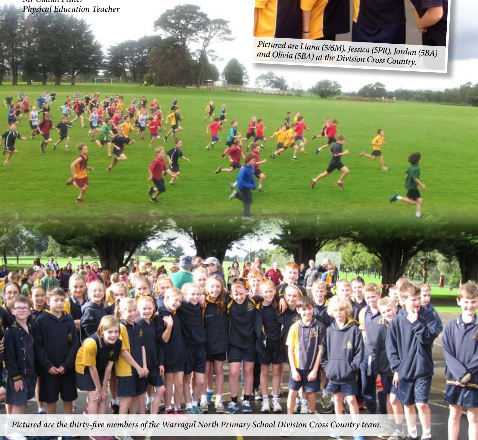
Pictured are the thirty-five members of the Warragul North Primary School Division Cross Country team.