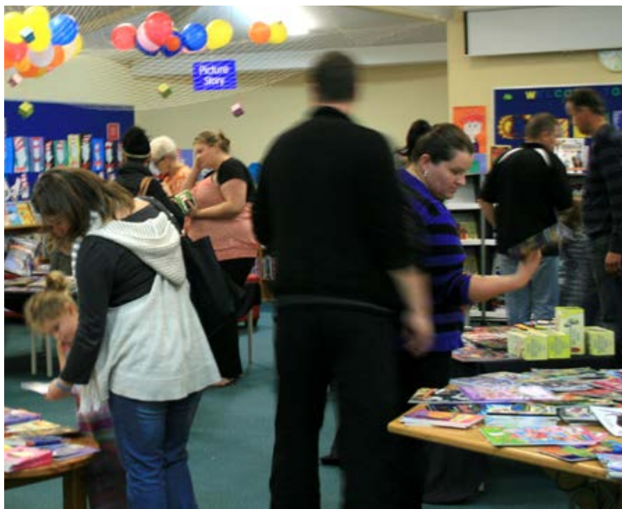
Pictured are many Warragul North families enjoying a visit to the Book Fair.