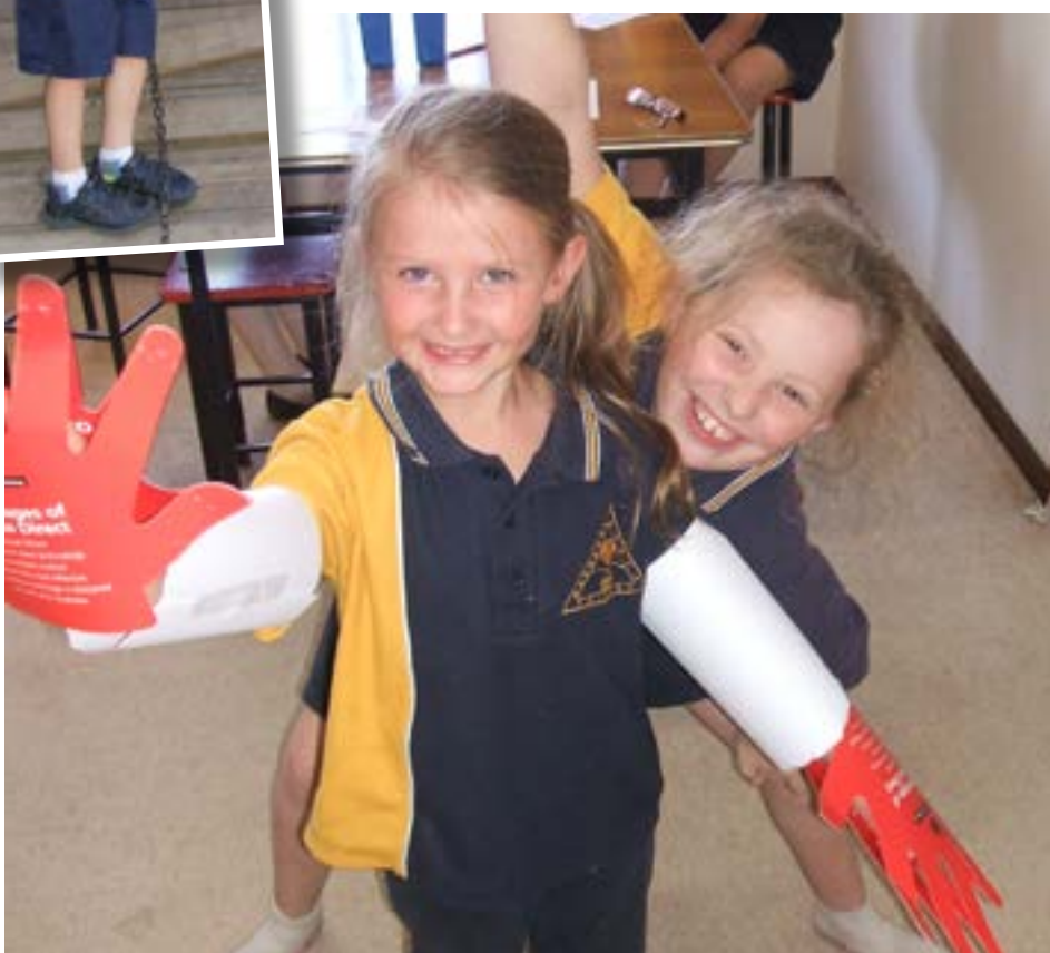
Pictured are some of the children enjoying their time at the Outside School Hours Care Program.