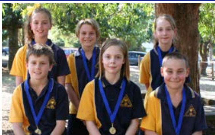
Pictured are the 9 and 10 year old age group athletics champions.