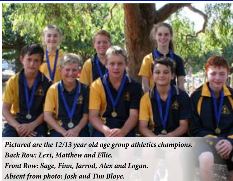
Pictured are the 12/13 year old age group athletics champions.