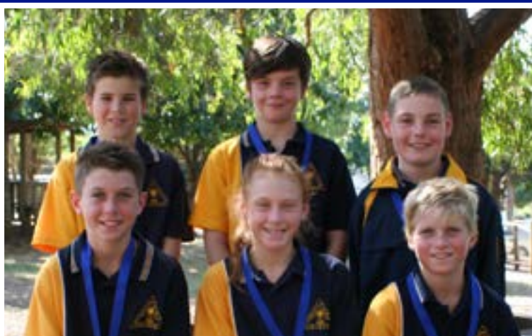
Pictured are the 11 year old age group athletics champions.