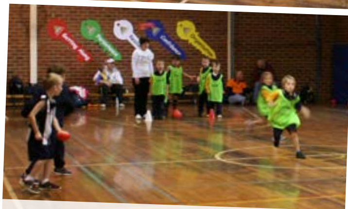
Pictured are the Active After-School Activities which were held at Warragul North Primary School during Term Two. The children had a great time enjoying Taekwondo, A.F.L. Skills and Zumba.